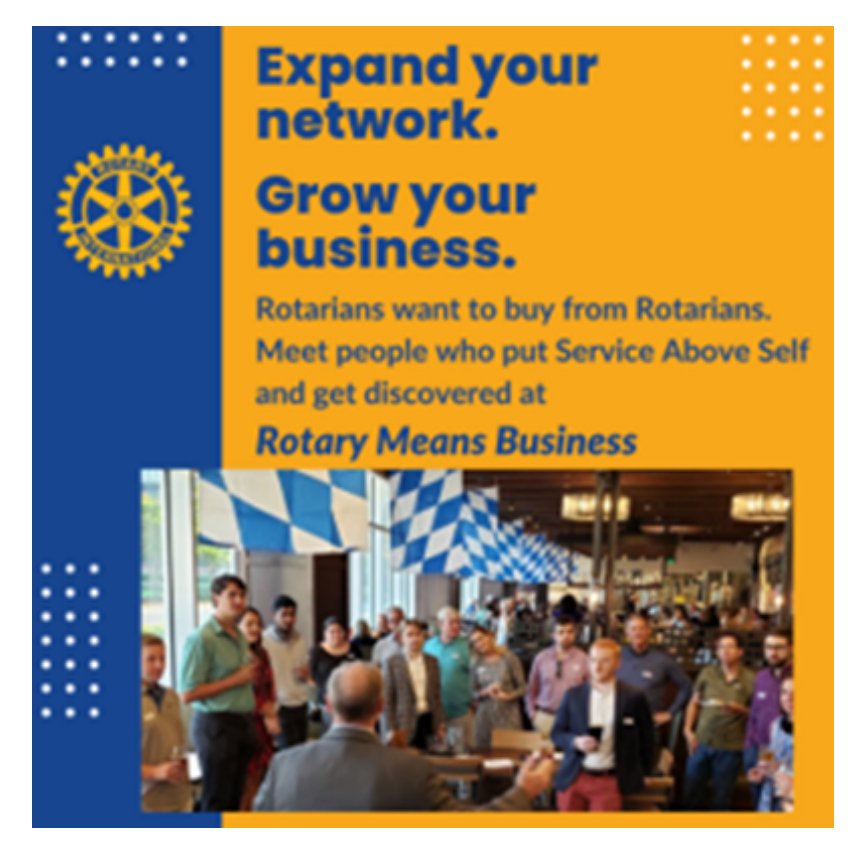
Bonus #1: This is also an opportunity for someone you are interested in recruiting to Roswell Rotary.

For you, or someone on your staff, grow your business by doing business with Rotarians in an environment that supports "Service Above Self"