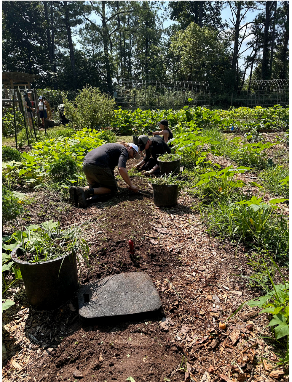
Last Week at Roswell Rotary