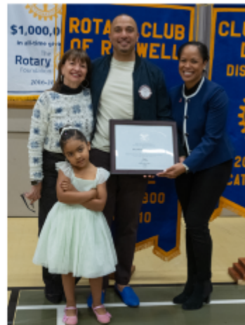
Frederick Levy Award for Hours of Service